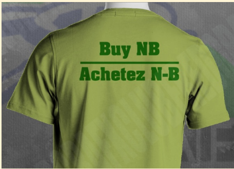
Reverse side of "Achetez N-B/Buy NB" t-shirt